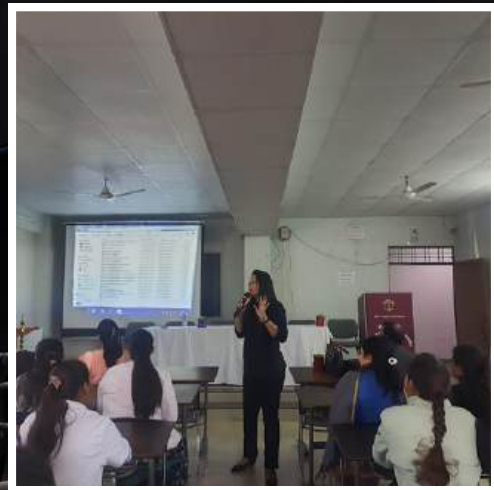
PERSONALITY BY JCI