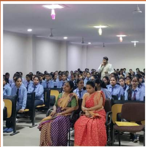
BHARAT ECO SOLUTION & TECHNOLOGIES, PUNE.