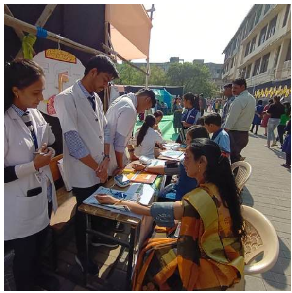
HEALTH CHECKUP AND PATIENT COUNSELLING