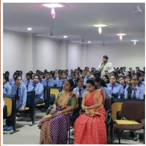
ON CAREER DEVELOPMENT PUNE)( MEDICAL CODING)