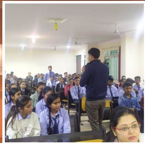
ON DELNET SOFTWARE