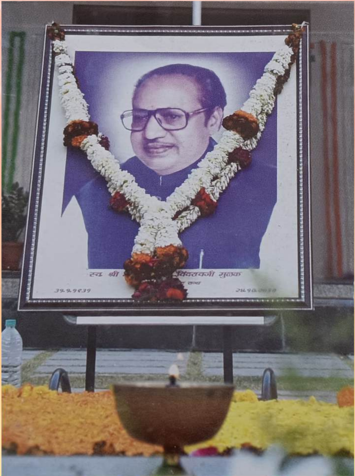
Late. Bhausaheb Mulak (Ex Minister Maharashtra State)