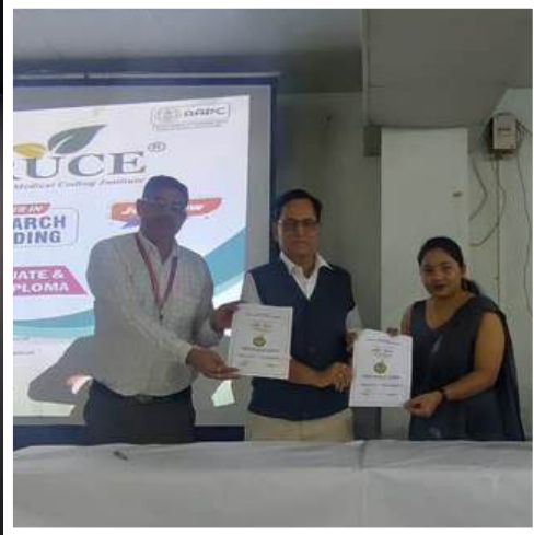
CAREER DEVELOPMENT ( MEDICAL CODING)