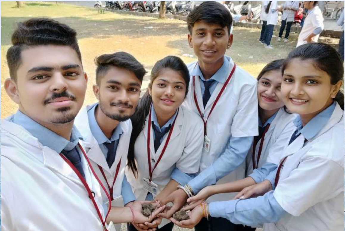
MEERA MATTI MEERA DESH