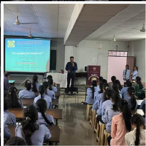
PERSONALITY DEVELOPMENT BY DESHMUKH SIR